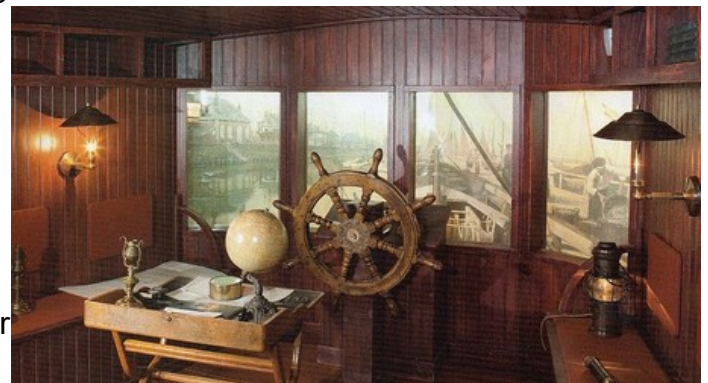
One of the rooms of the Verne museum, his former home, is made into the bridge of submarine Nautilus.