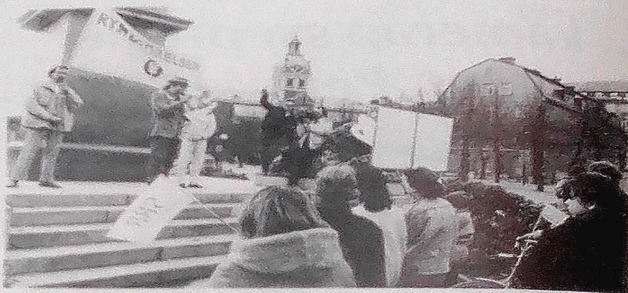
I Kungsträdgården bedriver Rymdrörelsen opinionsbildning och filmproduktion på samma gång.