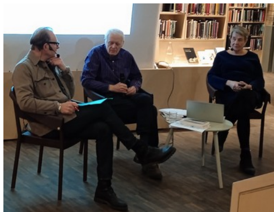
Holocaust panel. Former UN human rights commissioner Hammarberg in the middle

On the Holocaust memorial day Feb 27, there were many events, here and all over the world. I saw a discussion in my local library. The man in the middle is Thomas Hammarberg, former UN high commissioner of human rights. They of course also touched upon the genocide now committed by