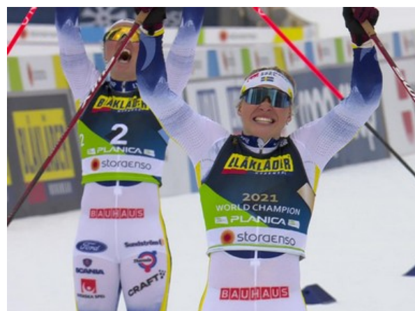
Jubilations as Jonna Sundling is crowned ski sprint world champ. Emma Ribom (behind) won silver, Maja Dahlquist (outside pic) won bronze.

In the first championship event, individual sprint, those four