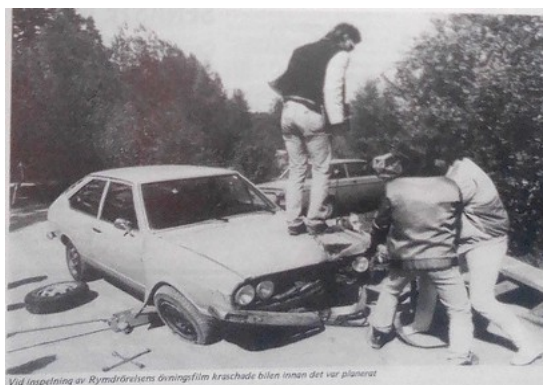
Vid inspektion av Rymdörelsets övningsfilm kraschade bilen innan det var planerat

A part of the plot was the campaign to free the film hero Hacke. That required a demonstration march in central Stockholm. We phoned the 100+ (mostly teenage girls) who had auditioned and gathered downtown, marching to Kungsträdgården, with police escort and everything yelling demands to scrap the Space Law and "Free Hacke"... Bystanders must have wondered, who the heck is this Hacke? Who were we? Anyway. It was all filmed and was the first space politics demonstration held here, maybe even the first in Europe or the world!