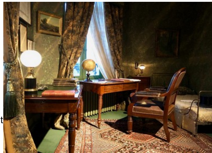
Jules Verne's study in Amiens. Looks cosy.