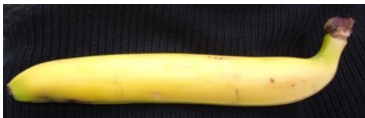
I found straight banana! Mutation from Putin's nuke labs?

other time. 3) It becomes 1.5 pages each time. If you think output is slow, it's actually becomes 500+ pages/year. 4) He never goes back to edit or cut. Only first drafts! 5) The finished notebooks never leave his home except for initially when he takes it to his publisher where an elderly lady