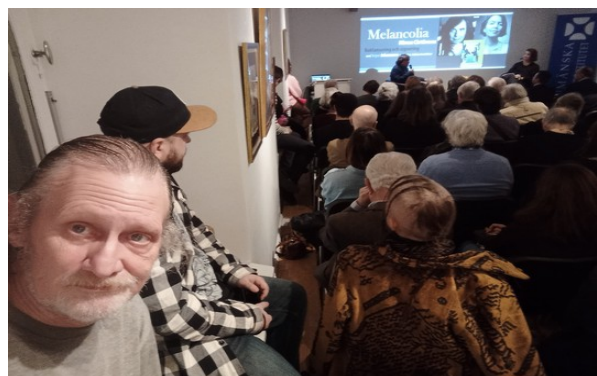
Cartarescu is quite popular. It was cramped. I got a window niche a bit from the stage.

everything in longhand, in special notebooks. 2) He writes every day, weekends too, between 10 and 12 AM. Never any