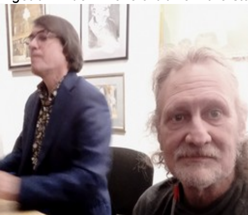
Mircea Cartarescu signs. His latest book in Swedish is Melancolia.

everything in longhand, in special notebooks. 2) He writes every day, weekends too, between 10 and 12 AM. Never any