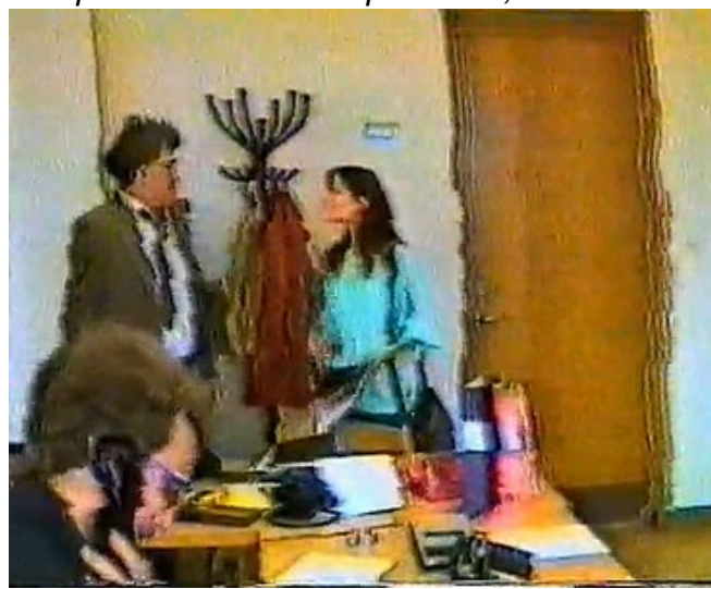
More from the staged magazine office in the Citizen House. Phone guy in front me, pretending to hunt for info on Hacke (I guess).