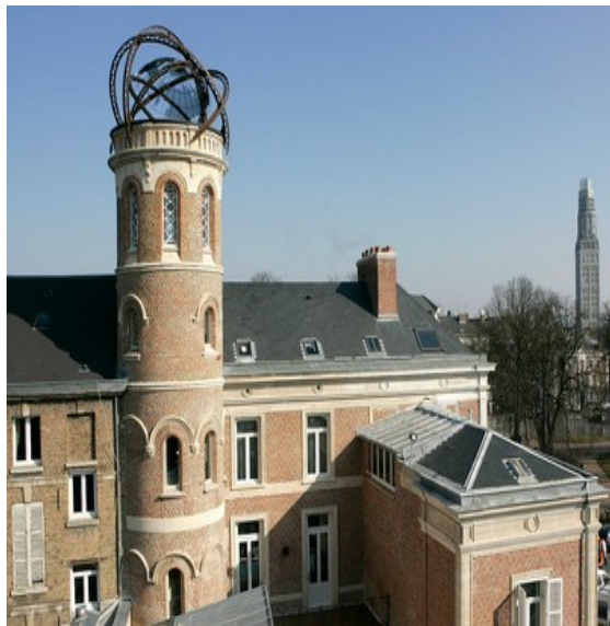
Jules Verne's home, 1 rue Charles Dubois, Amiens. Interesting tower. Do the arches represent planet orbits, or what? It's now a museum said to be well worth a visit.