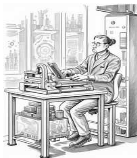
The AI was above asked to illustrate an sf fan printing on a mimeograph.