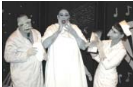
Masquerade Best in Show: "Fridays at Ten"