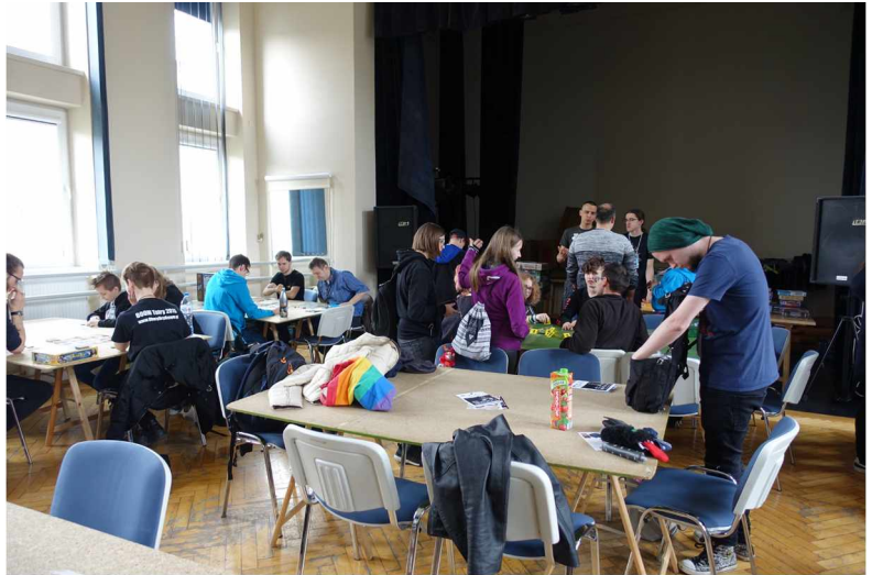
Games room during Lajconik 2019.

in other places. This was the case for years. There is a group of “travelling fans” and a way bigger local community that appears only at local cons. Kraków is not unique in this regard. I have seen similar tendencies in other big cities in Poland, yet I suppose it may be true for some other countries too.