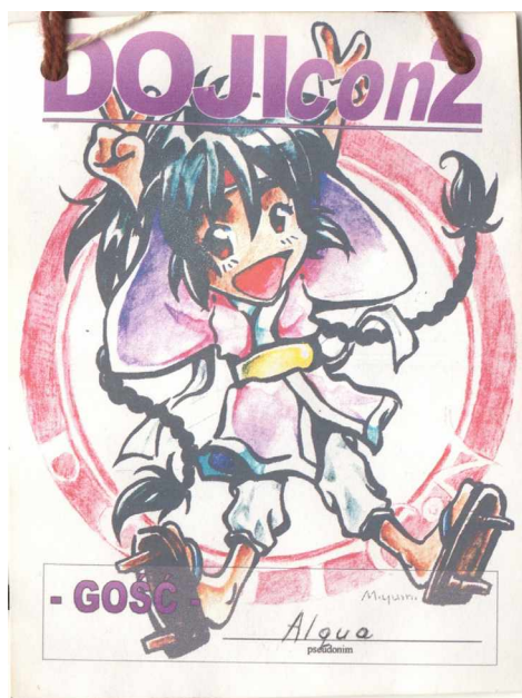
A badge from DOJIcon 2 – manga & anime convention from 2002.

Fanów Fantastyki (Galician Guild of SFF Fans). Imladris continued the “tradition” of being resurrected and it came back in 2013 thanks to the Historia Vita Foundation. It is luckier than Krakon. The revived con received rather positive responses and is still organized yearly. In fact, Imladris 2022 was hosting Polish natcon – Polcon.