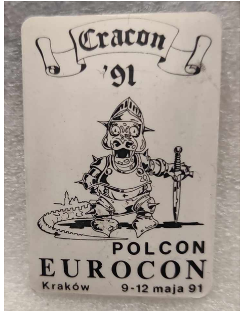
A pin from the Eurocon 1991 in Kraków.

I haven't found any indication about conventions organized in Kraków prior to the Cracon'91. It may have been the first convention in our city. I am not fully sure but fans who remember those times do not recall anything prior. The event was formally organized by a young club – Krakowski Klub Fantastyki (SFF Club of Kraków). In the programme book (or rather a souvenir book?) they put descriptions of many Polish SFF Clubs, including themselves. The description suggests that there were for-