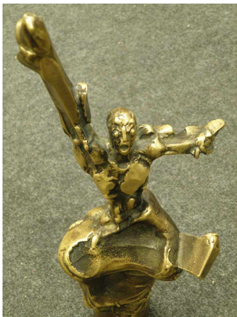
The Janusz A. Zajdel Award trophy

Why do I consider it the most important award in the field in Poland? That is a tough question! For one, it is old. It was originally given in 1985 for the works from 1984 while Śląkfa (award of Silesian SFF Club) is one year older. I think that the importance is related to a few facts. It is an award of fandom. Zajdel is not limited to any particular club or region. Although the number of voters is not very high (I believe around 300 in recent years), anyone can feel it is “their” award. Many people view it this way. Another factor is the relationship to our national convention – Polcon. For years it was the most important