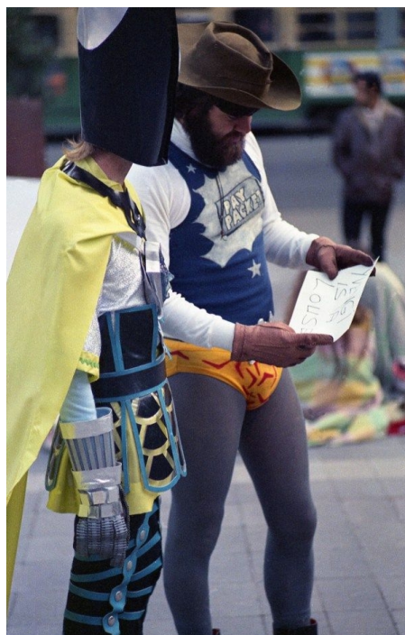
Below: Two shots from the Sydney bid film, 1983: