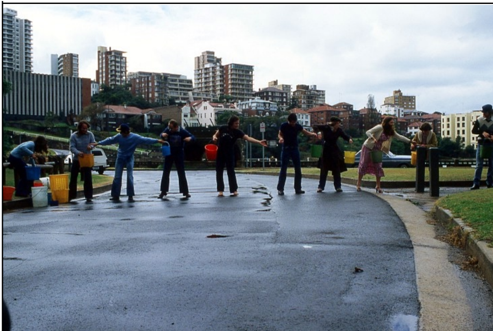
Above: The Filling of Sydney Harbour scene from the 1983 Sydney bid film: Assorted Sydney fans at the time: personnel not clear from the photo.