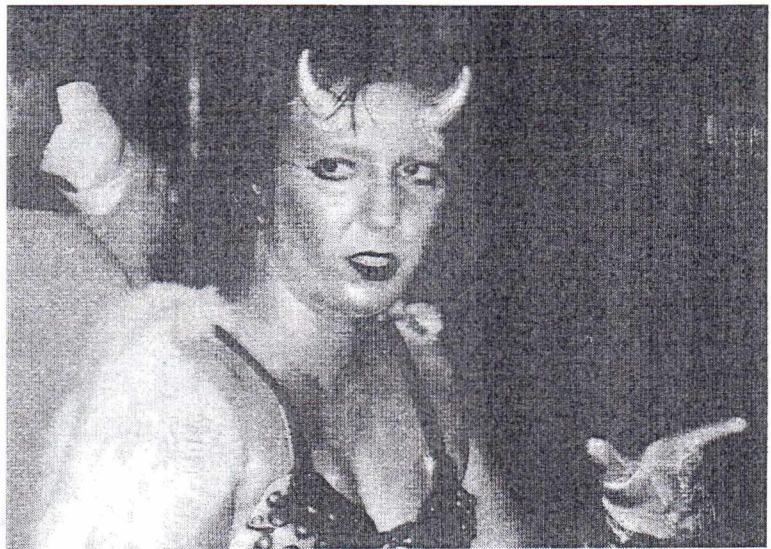
Devil Girl Telling Me Where To Go