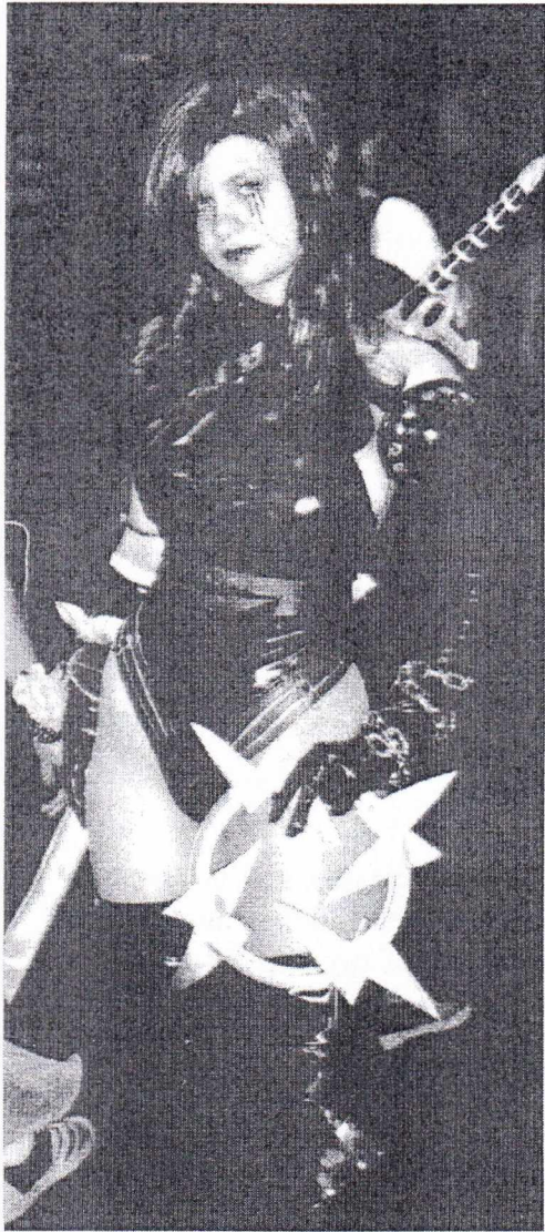
Dawn Comic Book Character