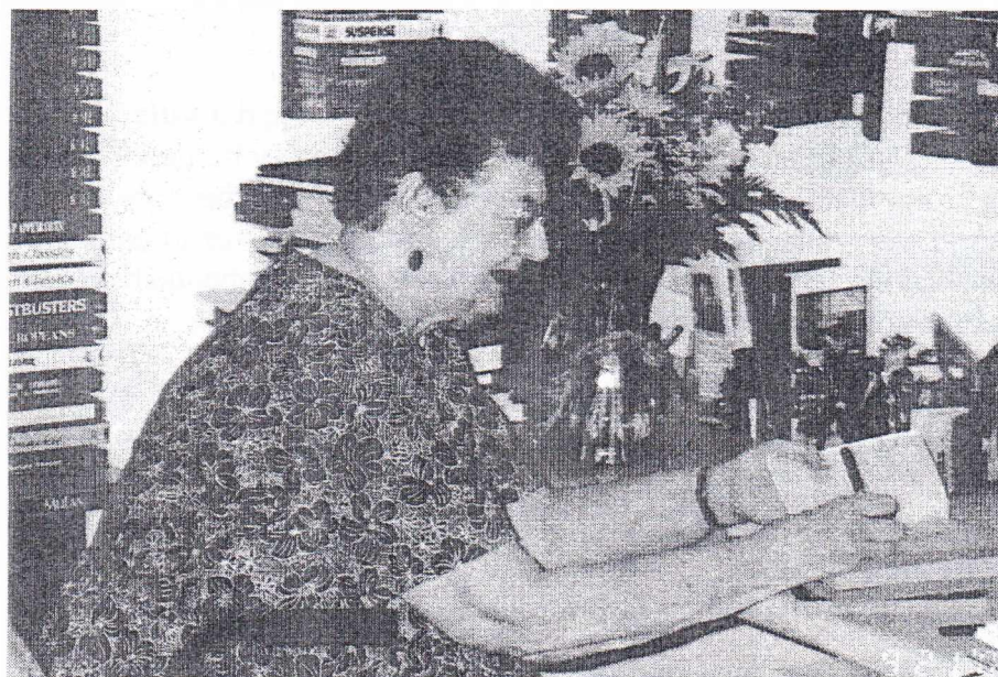
Andre Norton Signing at High Hallack