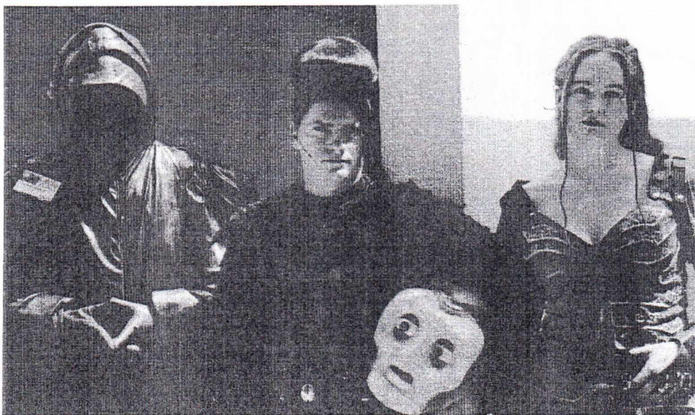
Characters from the Lexx TV Series