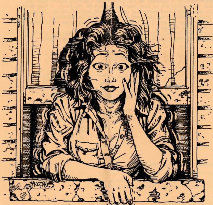
A SCENE FROM "WALKING ON GLASS"