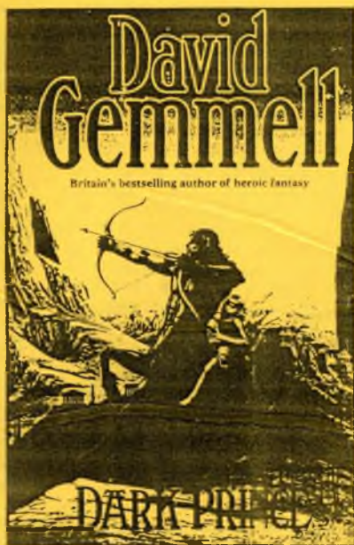
DARK PRINCE by David Gemmell Legend, £8.99.

still sticking fairly closely to historical fact. DARK PRINCE , however, goes much further. The emphasis has shifted from physical action to metaphysical, and although there are still battles galore, and much of the framework of the novel still has as its basis the actual events of the period, we are now taken far deeper into more typical Gemmell territory.