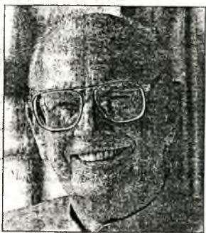
Arthur C Clarke, Knight Bachelor

Amongst the New Year's honours this year was Arthur C Clarke who became a Knight Bachelor.