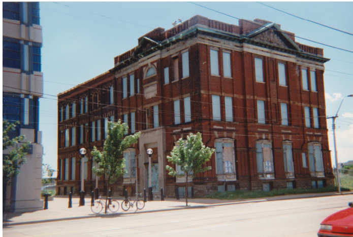
The Massey Bldg. on King Street, 1990s

And where those industrial empires once flourished are whole new orogenies of urban development. They seem solid now ... but give them a hundred years, no, fifty years , and we'll see!