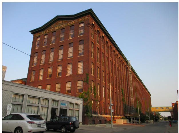
Toronto Carpet Mfg. King Street, 2015