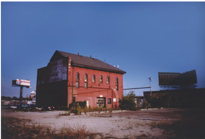
The Old Inglis Building, sometime in the 1990s

Satisfied that I could view the old Inglis building again from any imaginable angle by just clicking on a file, I resumed my journey.