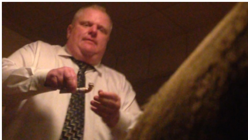
The Mayor Takes Another Crack at it...