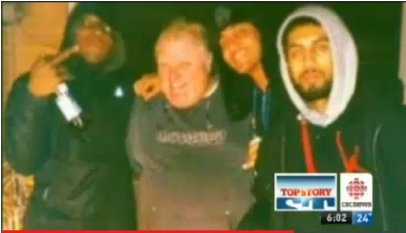
Rob Ford, photographed at a party with a low-life guy who was mysteriously found murdered shortly afterward.

looking all sweetness and light, a smarmy image of the man that falsely papers over the horror of the so-called "Ford Nation." But these are the images I will always remember the man by!