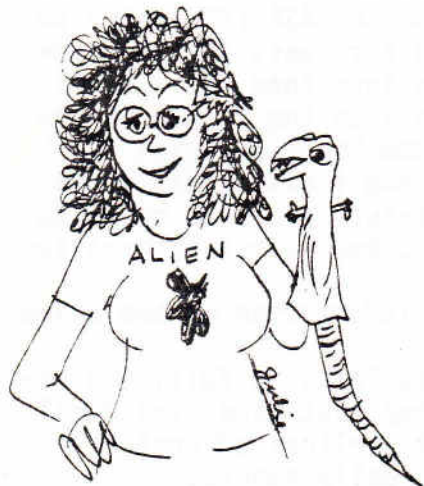
Everyone will want an Alien handpuppet.....

a Concom can verify, that's no way to do anything except make a quilt. The producers of Alien , not wanting another Bizarro Star Wars like Galactica or Star Crash , but wanting to ride the crest of the SF craze, called in about two dozen writers and told them to make a monster movie. So they put together The Thing from Outer Space , Jaws , and Close Encounters , and came up with a monster that's part Tyrannosaurus, part insect, part shark, and part humanoid. There is no single concept for the movie, and therein lies its gravest fault; the whole film seems spotty, almost whimsical. (For instance, the 'space jockey' found dead in the craft where the eggs are found is inspired by the Mayan carving that so intrigued Van Danikin.) This mishmash effect, along with the constant metamorphosis of the creature, the smoky, 'organic' sets, the 'smeared' dialogue, the non-existent plot, combine to create a movie that is very difficult to pin down intellectually. According to Newsweek , the creators intended this, but as a result I feel the movie lacks unity. Some films have an unmistakable aura, the mark of one man's vision; they come 'from the heart'. Star Wars had it, to name just one example; Alien doesn't. So don't expect Alien to be a great film; it's not the definitive monster movie, just the slickest.