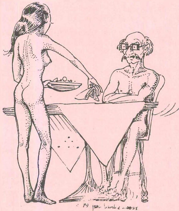
Vegetarian Nudist Restaurant