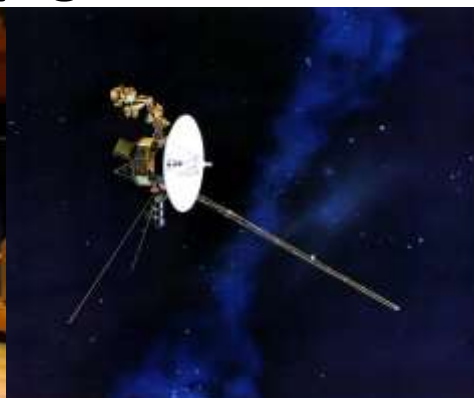
Voyager – artist's concept