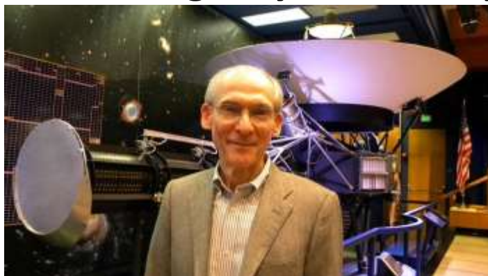
Dr. Ed Stone