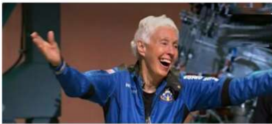
Aviation pioneer Wally Funk, the oldest person to fly in space

https://www.space.com/wally-funk-blue-origin-new-shepard-launch-reaction https://www.space.com/wally-funk-mercury-13-astronaut-history