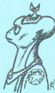
Illo by Rotsler

(The Treasurer serves for a term of 1 year - all other officers serve for six months)