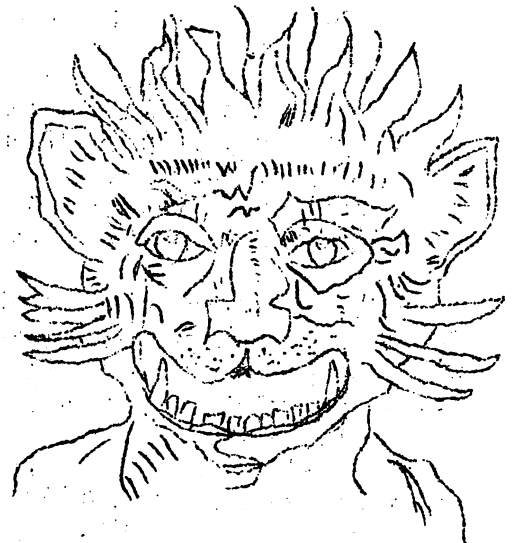
A Devil. (After Mandeville, Strasbourg, 1484.)

"Our modern conception of witchcraft, as it is known to John Doe Common Man, is the creation of the Christian Church. These concepts were fostered and spread by the Church through the inquisition to further entrench the power of the Church, place the fear of God into the people, and, not the least incidentally, to fatten the purses of the hierarchy of the Church, particularly those concerned with the Inquisition."