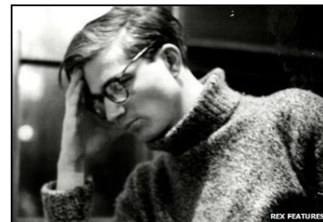
Photograph of Colin Wilson