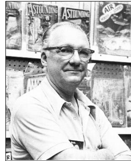
Fan Guest of Honor 1977 Worldcon