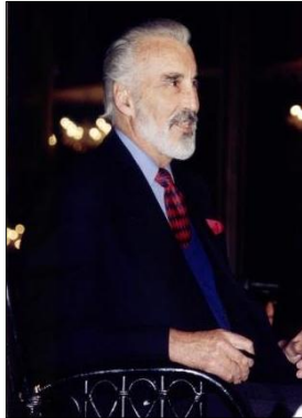
Halloween Weekend, London, 1997 100th anniversary, Bram Stoker’s Dracula

Lee was cast as characters from many literary and film franchises, often playing Dracula, co-starring in the Sherlock Holmes tale The Hound of the Baskervilles (1959), appearing as Fu Manchu several times, as the hero’s nemesis in The Three Musketeers (1973) and in Airport ‘77 .