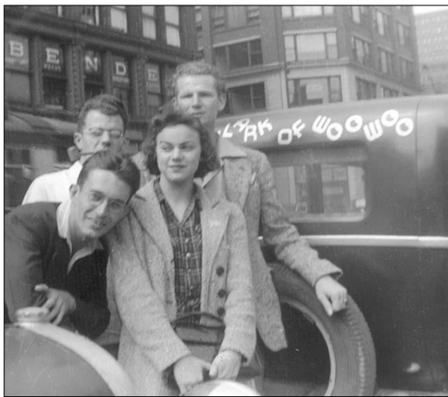
Skylark of WooWoo