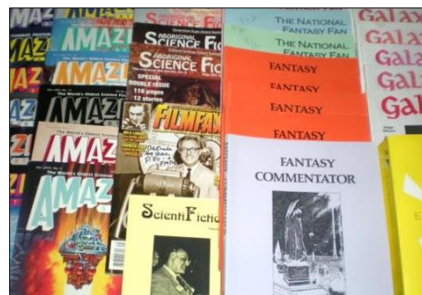
Amazing Stories, Fantasy Commentator, Filmfax, Galaxy, National Fantasy Fan

SF Gateway Omnibus – four novels by E.E. "Doc" Smith (issued in 2013).