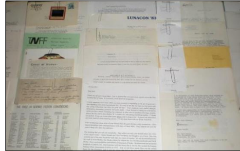
Some of Jack's written correspondence