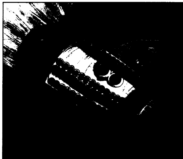
(Artwork by Lyndon White)

The Visual History of Science Fiction Fandom, Volume Two: 1940 will bring this chapter in the history of fandom to life. In our usual style we present high-resolution, full-color scans of original artifacts such as fanzines, correspondence, and art. We also present several original documentary-style comics, lavishly illustrating key scenes from the history, such as the travelogue of two fans who traveled from Colorado to Chicago by hopping rail cars. Throughout it all, we contextualize and unpack the story of fandom with a deeply researched narrative.