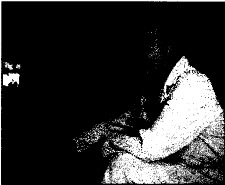
Robert A. Heinlein, Guest of Honor 1961 Worldcon (Seattle)