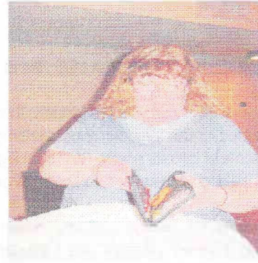
FOR SFPA 227 -- MC's on 226

Norm M. in TYNDALLITE V3#100: Still on Austronesians. Going across the Pacific, I understand the deal was for the young men to go looking for the next islands ... or die. Yes, it was quite an achievement to island hop the way they did. Population pressure.