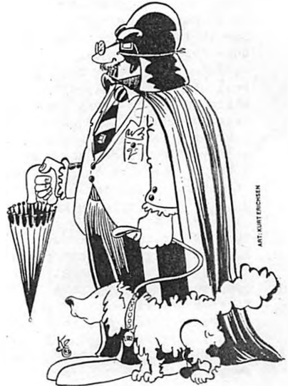
Darth Vader. Celebrity. dons a disguise to avoid publicity.