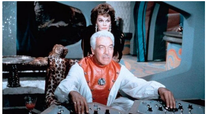
Latitude Zero 1969

A 30-minute SF series, Latitude Zero, was broadcast for 17 episodes on NBC in 1941, but only one episode has survived. The plot concerned a mysterious submarine captain, Craig Mackenzie, and his bodyguard Simba. The submarine, The Omega, was built in 1805, and MacKenzie and Simba were capable of piloting it alone. The plot involved fighting enemies of an undersea world. Lou Merrill played MacKenzie. A foreign movie based on the series was made in 1969, starring Joseph Cotten.